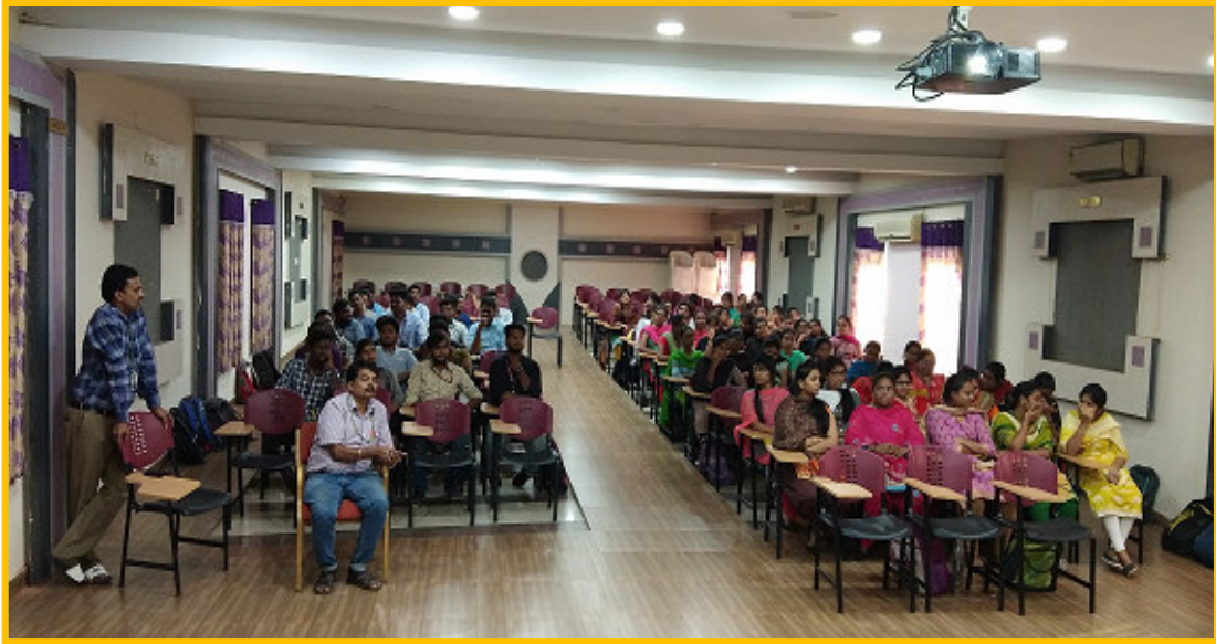
Fig: Active involvement of the students in Technical talk session.