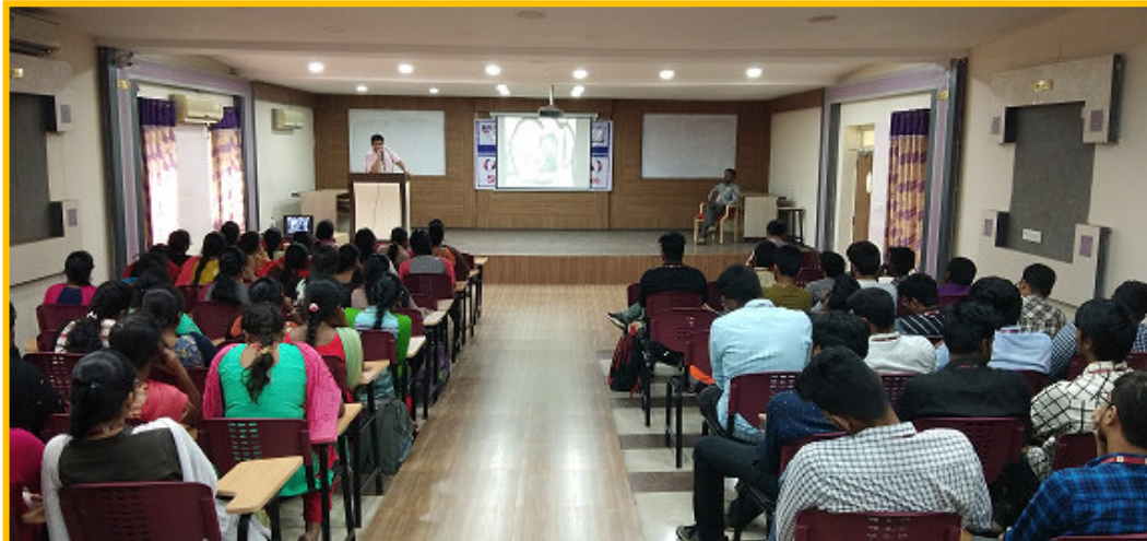
Fig: Students actively participating in Technical talk session.